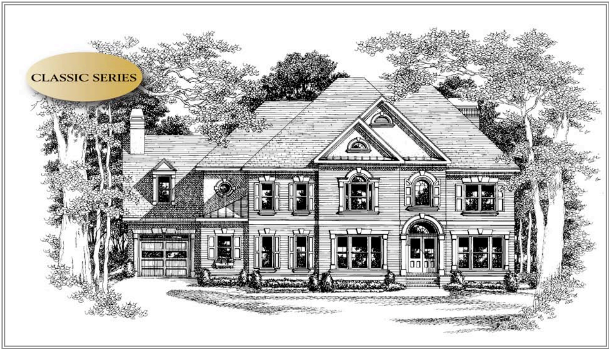
Elevation with Brick and Stucco