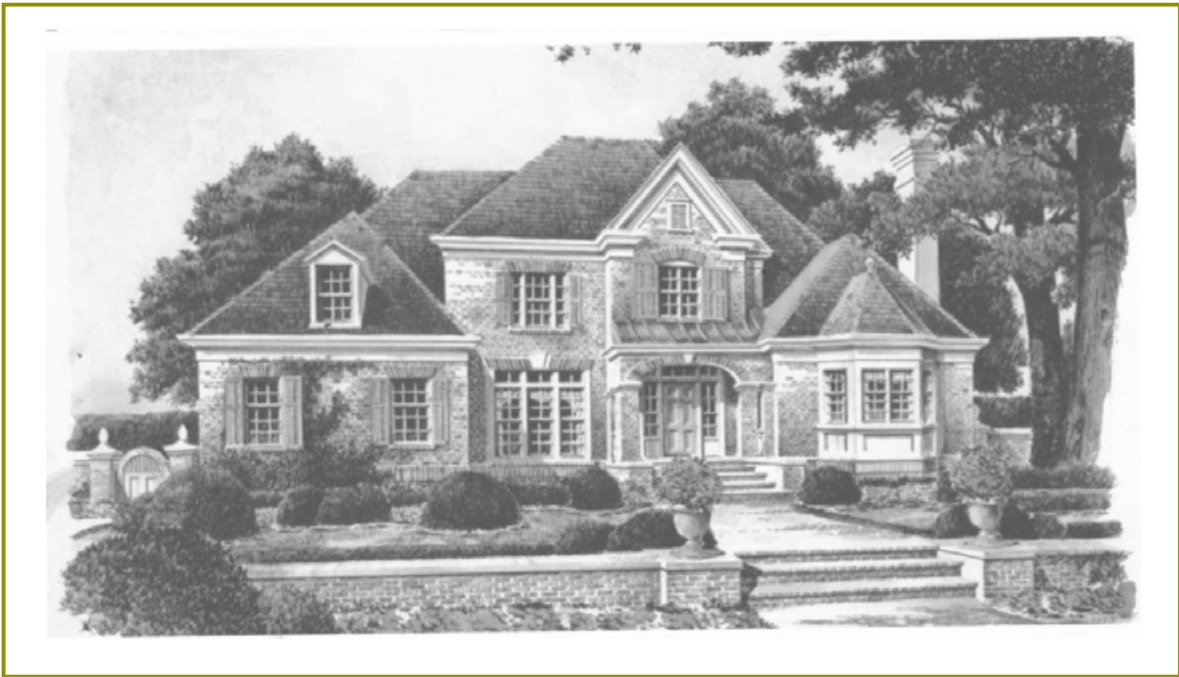
Elevation with Brick and Optional Metal Roof