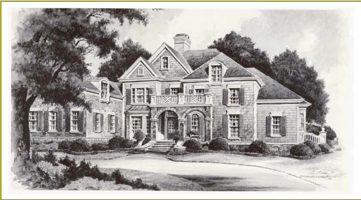
Elevation with Optional Dormer on Upper Roof and Conservatory